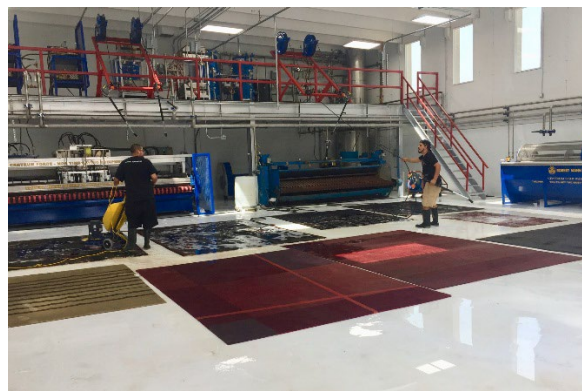
Wash Floor—Robert Mann Oriental Rugs READ WHAT OTHERS ARE SAYING ABOUT THIS CLASS!